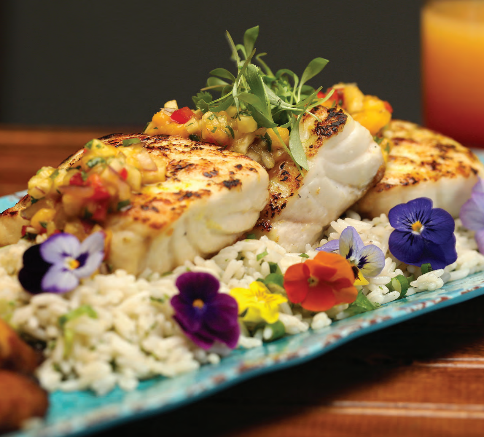
Tropical Florida Fish with Caramelized Plantains, Scallion Rice & Pineapple Mango Salsa

Arthur's will make your summer party a breeze, with creative ideas and turn-key planning services.